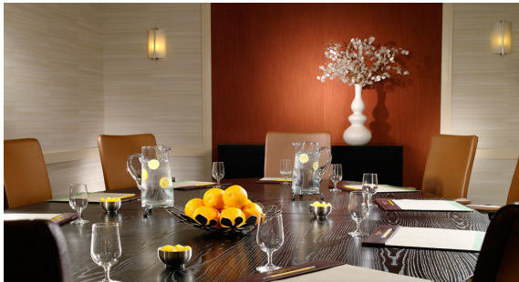
Experience green meetings at Atlanta Marriott Marquis, GA

We know that successful meetings and events don't just happen on their own. It all starts with a plan—and a planner. That's why we've created a way to help you make the most of your choices. Our Rewarding Events program is designed to reward your hard work. We think you deserve to enjoy the fruits of your labor—like the option to earn Marriott Rewards® points or airline miles when you host a meeting or event at participating properties.