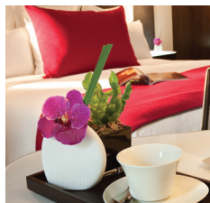
Renaissance® Paris Ave de l'Empire Hotel, France